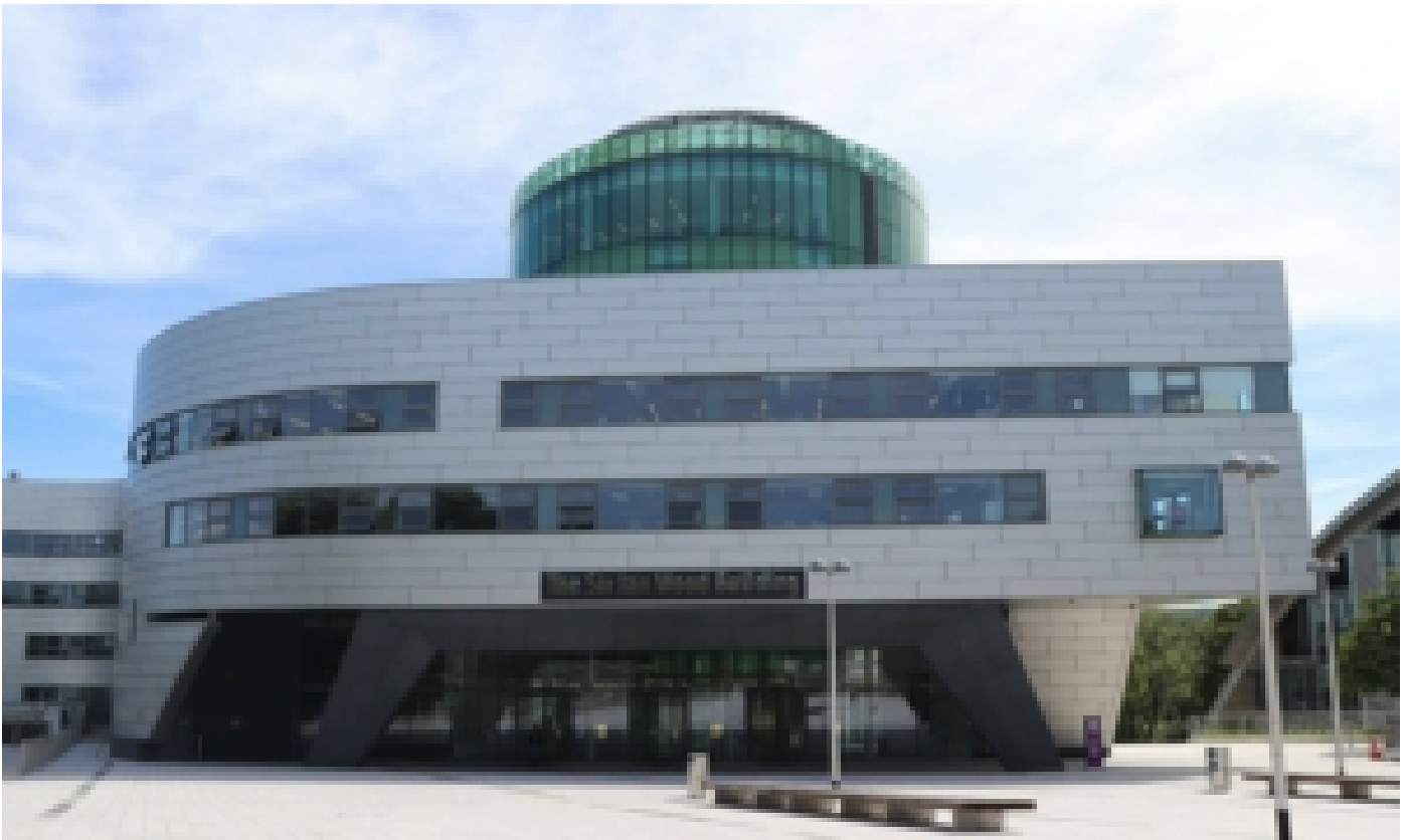
Sir Ian Wood building at Robert Gordon University (RGU), Aberdeen