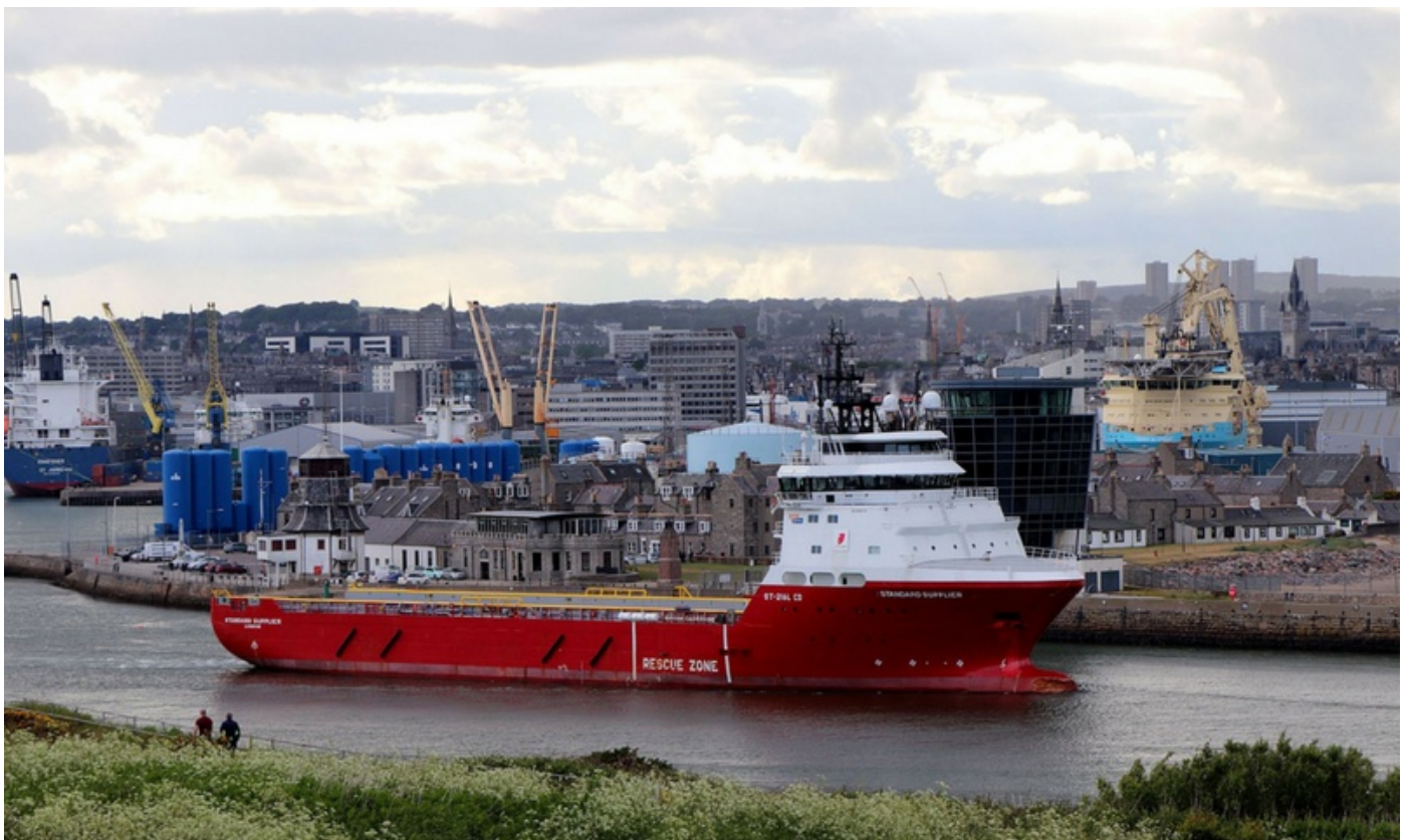
A view of Aberdeen harbour and Marine Operations Centre from Torry.

Two decades ago, the North Sea was one of the world's largest sources of oil. Over the next decade or so, thousands of sub-sea wells will be plugged, and hundreds of oil and gas production platforms detached and removed from the North Sea. This could become one of the largest ever exercises in industrial decommissioning. Addressing the environmental impacts and engineering challenges of decommissioning is complex, and even more challenging at a time when the price of oil continues to fluctuate. In addition, according to experts, closing down oil and gas operations in the North Sea is likely to cost double the government's current target, leaving younger generations with a hefty tax bill.