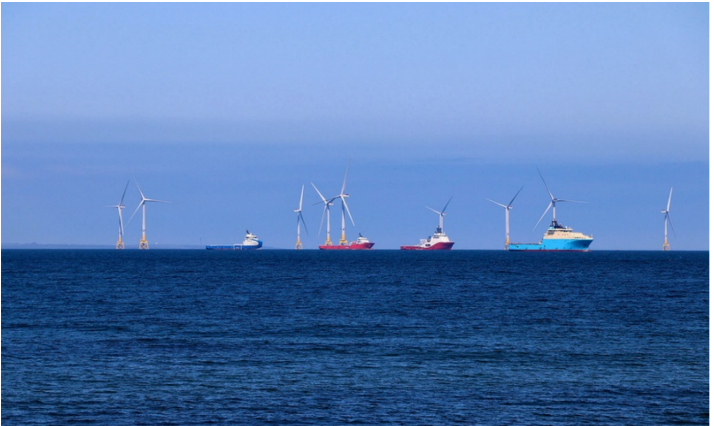
A view of Aberdeen Bay Windfarm, a major offshore windfarm project off the coast of Aberdeen, from The Marine Laboratories, Scottish Government in Aberdeen.

The root cause of the conundrum is human nature itself. A post-carbon culture will be unlike the one we have today. It will require a global cultural shift in our value-systems and ambitions to build a sustainable future block-by-block. Then again, transitions are also a matter of social and economic justice. Poor and vulnerable communities across the world are at the frontline of climate change and are the most affected by its consequences. So addressing the climate challenge is also about rebuilding structures and systems to ensure that there is sustainable prosperity, economic health and economic growth for all. The transformation to a low carbon economy must be built on a foundation that is socially just, fair and equal for all, one that secures the future and livelihoods of workers and other vulnerable communities who are involved in high carbon sectors and rely on fossil fuel industries for work.