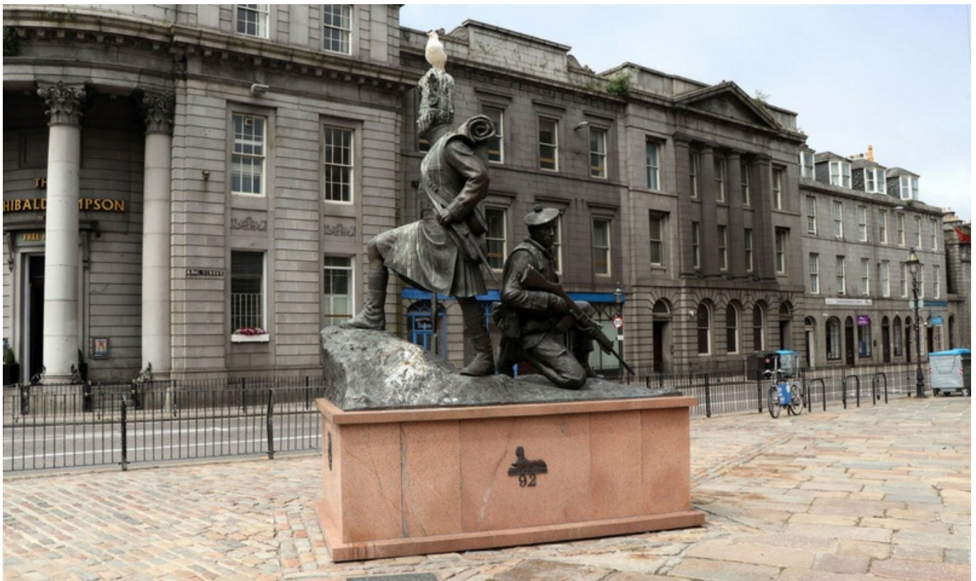
The city of Aberdeen in its Granite Glory.

The petroleum industry in Aberdeen began with the discovery of significant oil deposits in the North Sea during the mid-20th century. The first UK offshore oil field was discovered in the late 1960s east of Aberdeen, further oil fields in the 1970s, and these were instrumental in transforming Britain both politically and economically. Aberdeen soon became the centre of Europe's petroleum industry with an essential service port supporting offshore oil rigs and experienced an economic boom in the last three decades of the 20 th century. Aberdeen developed world class expertise in engineering in very problematic and challenging surroundings.